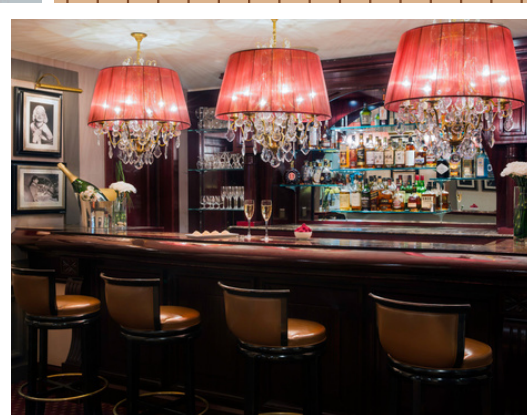
The Bogie's Bar